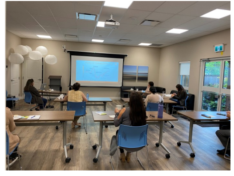
Our staff and board have been participating in educational Lunch & Learns on various topics because of our commitment to equity, diversity and inclusion.