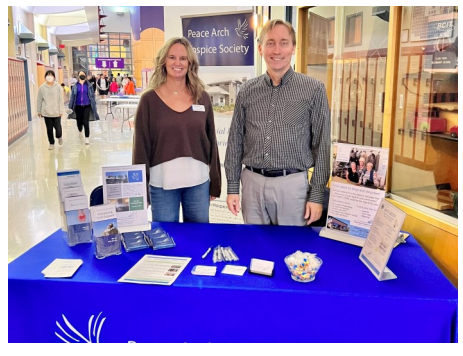
We've been grateful to attend several community awareness events to promote the work we do.